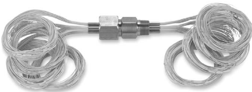
Multiple high density units passing through the multiple holes of an MHM gland produce an assembly capable of accommodating hundreds of wires or thermocouple pairs.