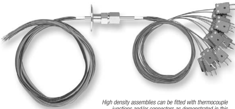
High density assemblies can be fitted with thermocouple junctions and/or connectors as demonstrated in this assembly for the pharmaceutical industry.