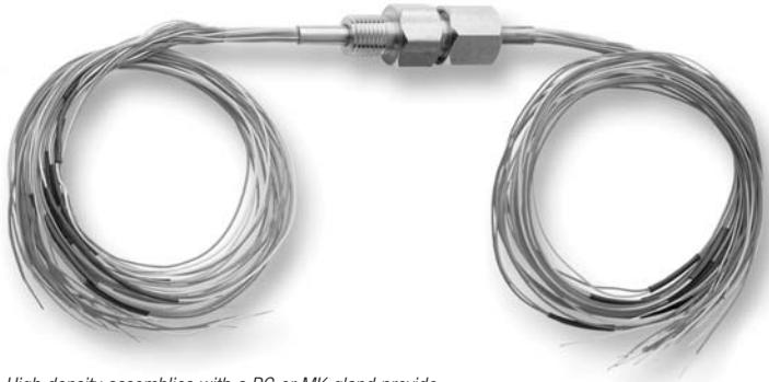
High density assemblies with a PG or MK gland provide a continuous sealed wire feedthrough accommodating up to 60 wires or 30 thermocouple pairs.