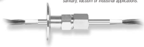
High density gland assemblies can be fitted with KF, CF, SFA and ASME/ANSI style flanges for use in sanitary, vacuum or industrial applications.