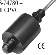
LS-74780 – All CPVC

Particularly well suited for rough service. Ideal for use in chemical and plating applications.