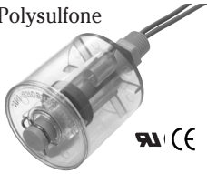
LS-30 Series– Polysulfone

For water-based liquids, with limited use in oils and chemicals. Cost is suited for high volume OEM use. Polysulfone material of construction complies with FDA food contact regulations.