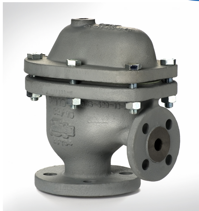
Pressure Ranges [bar] EB 1.10, EB 1.11

Operating instructions, know how and safety instructions must be observed. All the pressure has always been indicated as overpressure. We reserve the right to alter technical specifications without notice.