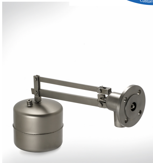
illustration shows NV 98FP

Operating instructions, know how and safety instructions must be observed. All the pressure has always been indicated as overpressure. We reserve the right to alter technical specifications without notice.