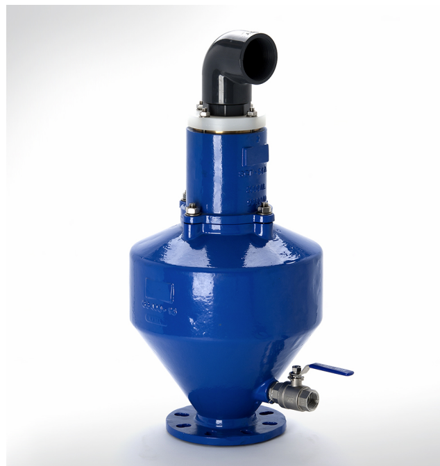
Air Flow Rate [m 3 /h] at 0°C, 1013 mbar, Nominal Pressure PN for standard design

Operating instructions, know how and safety instructions must be observed. The pressure has always been indicated as overpressure. We reserve the right to alter technical specifications without notice.