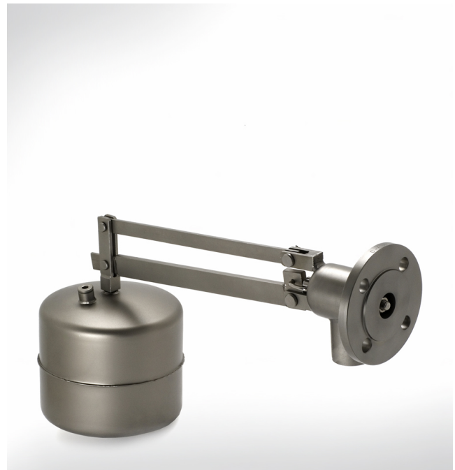
illustration shows NV 98FP

Operating instructions, know how and safety instructions must be observed. All the pressure has always been indicated as overpressure. We reserve the right to alter technical specifications without notice.