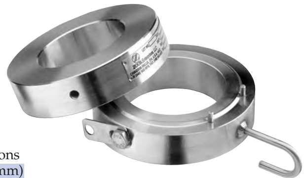
Holder Dimensions Inches (mm)