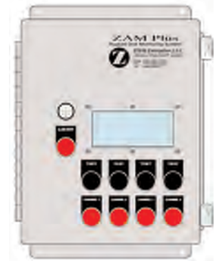
ZAM4 4 Channel Monitor