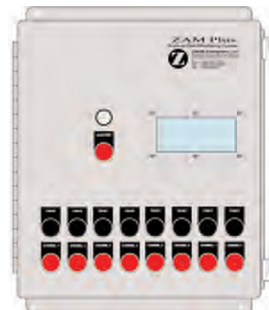
ZAM8 8 Channel Monitor