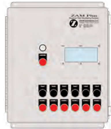
ZAM6 6 Channel Monitor