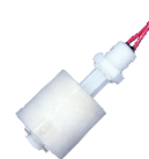
LS-3 Liquid Level Switches