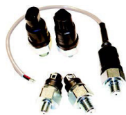
PS61 Sub-Miniature Pressure Switches

Visit gemssensors.com to View Our Full Range of Products