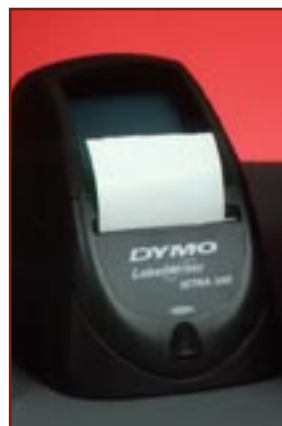
Setra 300 Dymo Labelwriter Printer

For portable operation, the QuickCount can be powered by an internal, 12 volt, 2.3 Ah, lead acid battery. When the battery is fully charged, it will operate the scale for a full shift and will recharge when the scale is left plugged into an electrical outlet for several hours.