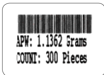
Label printed with DYMO SE300 Printer

Data can be entered into the database using the user-friendly, cell phone style keypad, or a PS/2 style keyboard. The scale menu system offers a wide selection of features and is easy to access, easy to navigate, easy to exit. Use it to customize display prompts, or set the optimal sample size for counting. Use the transaction log to create a summary of daily activity.