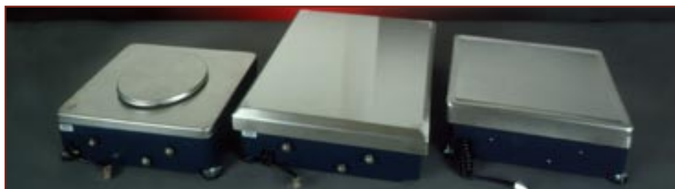
The Super II Family: (From Left) 2-5 Kg Capacity, 25-50 Kg Capacity, and 12-16 Kg Capacity

Multiple RS232 ports are available to keep you constantly connected...to a scanner, to a printer, to a computer, to your bulk weighing scale and to up to eight bases.