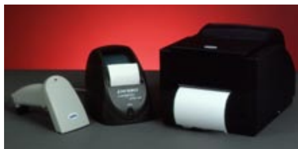
SuperII Peripherals: (from left) 500 Scanner, 300 Dymo Printer & 400 Direct Thermal Printer

Where ambient lighting conditions are poor, CCFL backlighting provides a bright, easy to read display from any angle. And thanks to minimal power consumption, it can provide hours of service even when operating off the scale's internal battery.