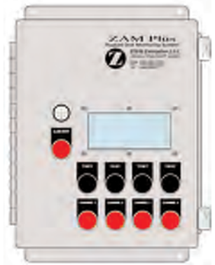
ZAM4 4 Channel Monitor