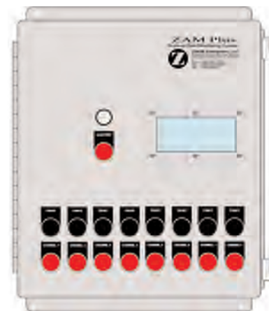
ZAM8 8 Channel Monitor