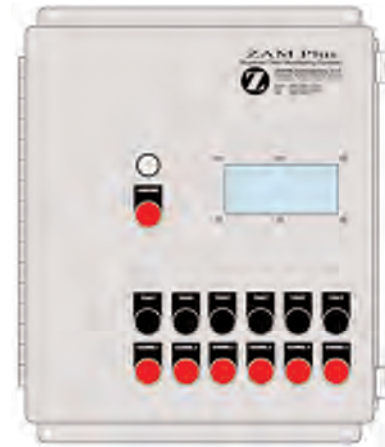
ZAM6 6 Channel Monitor