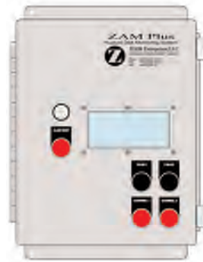
ZAM2 2 Channel Monitor

The ZOOK ZAM alarm system is capable of detecting a ruptured disk condition in applications involving highly electrically conductive fluids. Contact ZOOK for more information regarding this type of application.