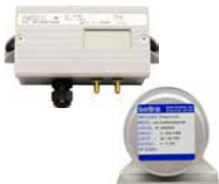
Differential Pressure Sensors