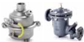
Steam & Condensate Traps