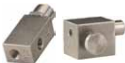
Excess Flow Valves