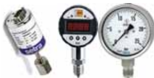
Gauges & Manometers