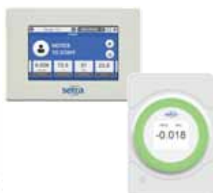
Room Condition Monitors