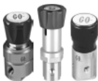
Pressure Reducing Regulators