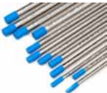
Metal Tubing & Piping