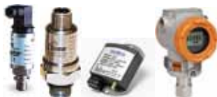
Pressure Transducers & Sensors