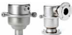
Bleeding & Venting Valves