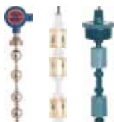
Multiple Point Level Sensors