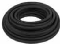
Tygon® & Versilon® Tubing