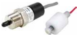
Single Point Level Sensors