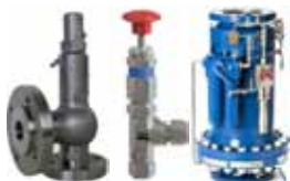
Safety & Relief Valves