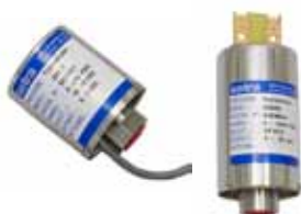
Industrial Pressure Transducers