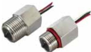
Electro-Optic Level Switches