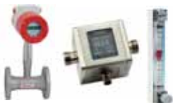
Flow Meters & Sensors