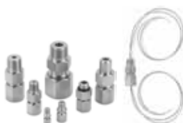
Wires & Seals