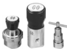
Back Pressure Regulators