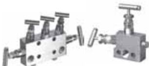
Block & Bleed Manifolds