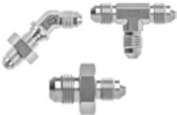
Industrial Pipe Fittings