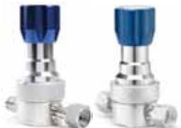
UHP Pressure Regulators